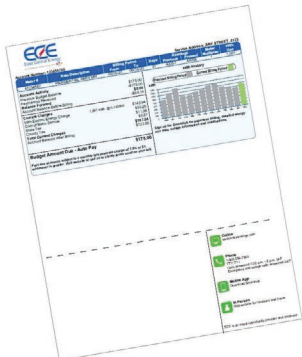
CREDIT ON BILL Active, current members

Most members who have been with ECE for over a year will receive a payout!